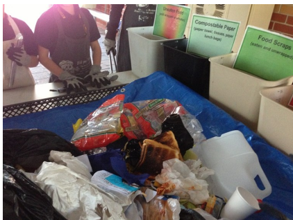
The Bin Materials Audit at Highbury PS.

presented the first of many talks on Highbury's WOW waste audit and actions to become more sustainable through recycling.