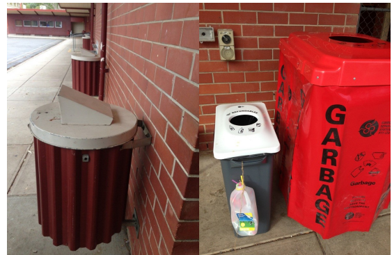
Before and after pictures of the bins in the yard. There are fewer bins and a 10c container collection with a bottle for straws and lids.