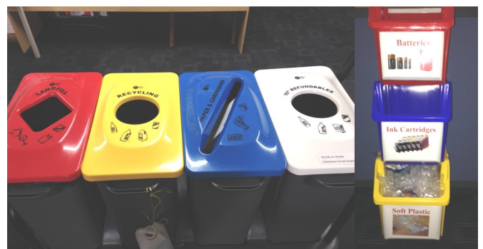
Staffroom and office bin systems to collect recycling, batteries, cartridges and clean film plastic.