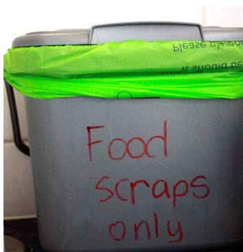
The kitchen caddy with compostable liner for the children's food scraps.

As all food is prepared on site, kitchen staff dispose of food scraps to a 60 litre organics bin, also lined with a compostable bag. This bin is emptied daily to a 240 litre green organics supplied by SITA. The organics bin materials are collected once a week by Jeffries organics recyclers at a cost of $8 per bin collected (plus an annual fee).