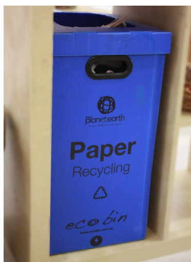
A 25 litre bin for recycling located near the children's drawing area.

25 litre recycling bins for paper and cardboard are placed around the centre (classrooms and offices) and are easily accessible to staff and children.