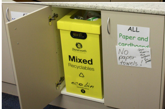
It's easy to recycle in the staff room; staff have turned cupboards into a materials separating system.