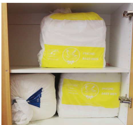
Every week, used nappies are collected and replace them with clean ones.

Used cloth nappies are put in a 240 litre bin and collected weekly. New staff are trained in folding and changing cloth nappies.