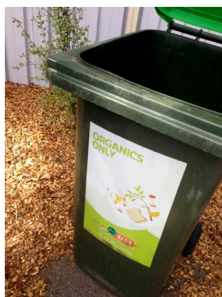
The 240 litre Organics bin.

The staff room also has a collection for 10c drink containers with funds raised used within the centre.