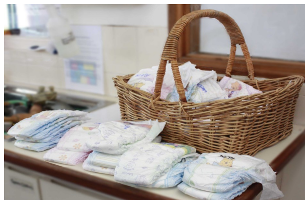
Families must provide their own nappies if they prefer their child to wear single use nappies.

Single use nappies are no longer provided as the centre stopped purchasing single use nappies in 2013. If a child's carer does not provide enough nappies for the day, the child will go home in a cloth nappy and the family is responsible for washing and returning it to the centre.