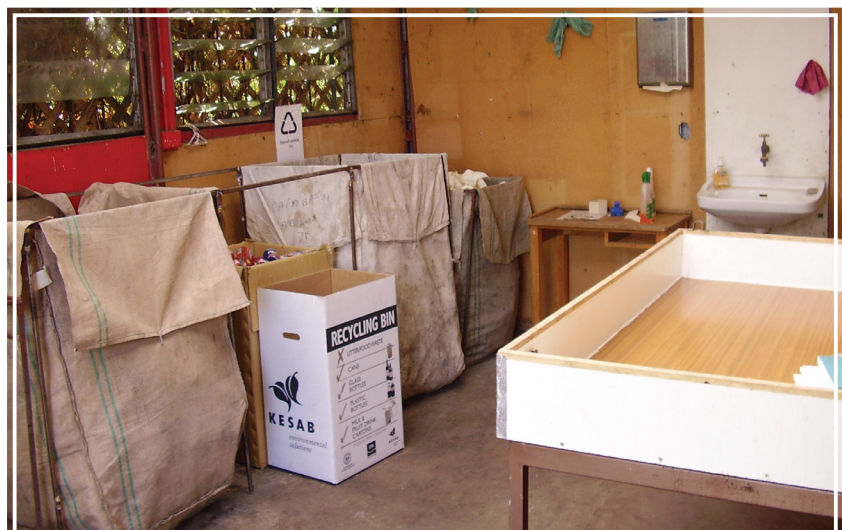
Well organised shed used by the Recycling Group