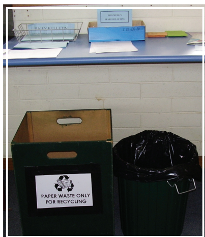
Paper recycling in admin areas

The Recycling Program collects paper / cardboard waste from various locations around the school and drink containers from recycling bins located throughout the schoolyard. These materials are then sorted in the recycling shed, prepared appropriately, packed and transported to the recycling depot. The recycling bins are cleaned and repositioned.