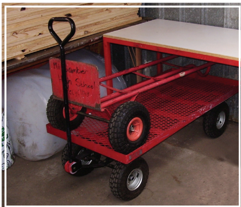
Equipment used by the Recycling Group