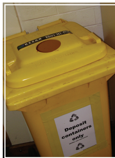
Different coloured bins for 5c containers