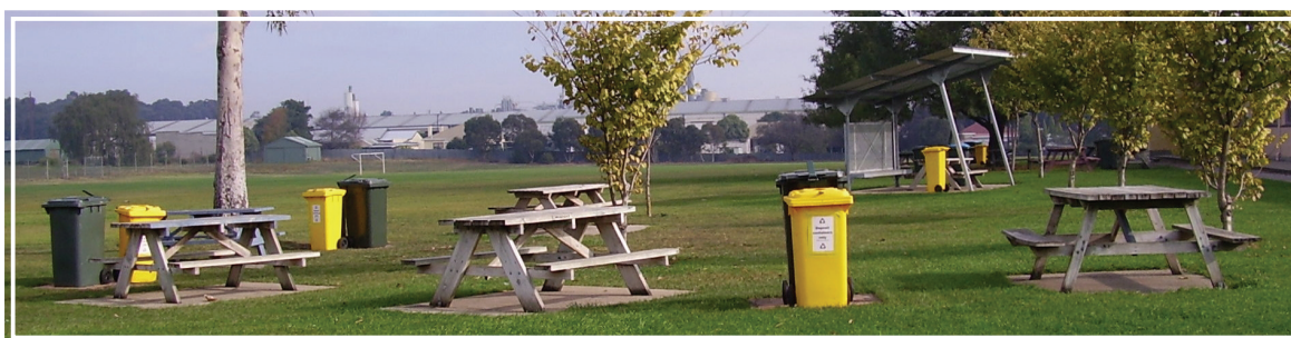
Highly effective and visible 5c collection containers are placed next to rubbish bins

'Students at Mount Gambier High School have the opportunity to become involved in a number of initiatives that aim to improve the health of our environment and reduce the day-to-day impact people have on their natural resources. The minimisation of the amount of waste produced by the school has been identified as achievable and the outcomes measurable.'