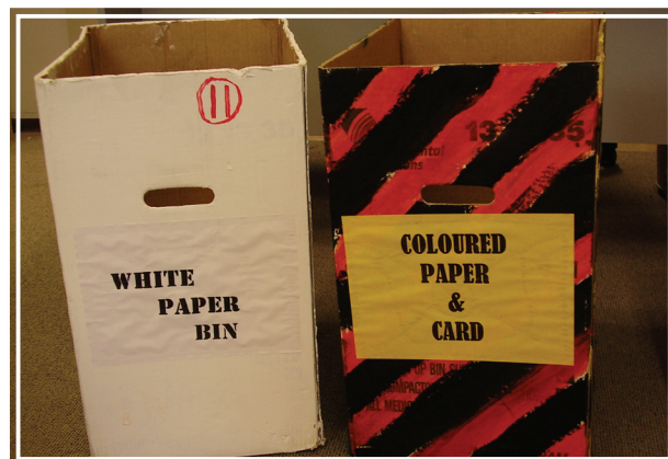
Painted boxes clearly show type of paper required

5c container recycling was initiated after Container Deposit Legislation was extended in 2003 to include 'fruit box' style cartons. 15 crates with effective signs are placed around the school to make the system easy for students to use.