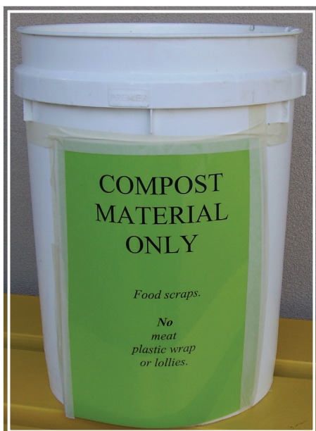
Clearly labelled food scrap buckets

Food scraps are collected and composted by Year 2/3 and Year 4/5 classes. A previously successful vegetable garden from which produce was used for soup days is being re-established in a new location in 2006 after recent extensive school redevelopment. Worm composting is also planned for 2006.