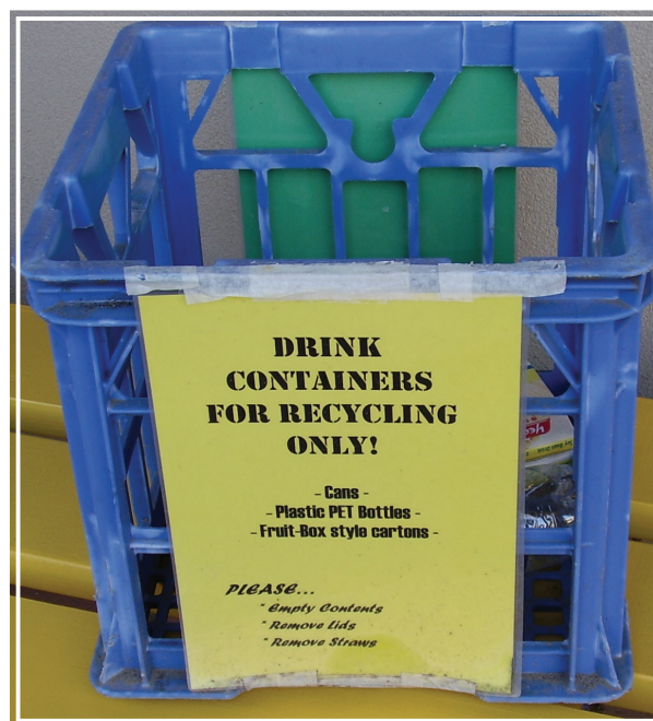
Crates and buckets are located next to rubbish bins around the school