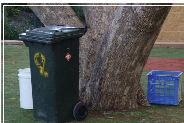
Crates and buckets are placed near bins