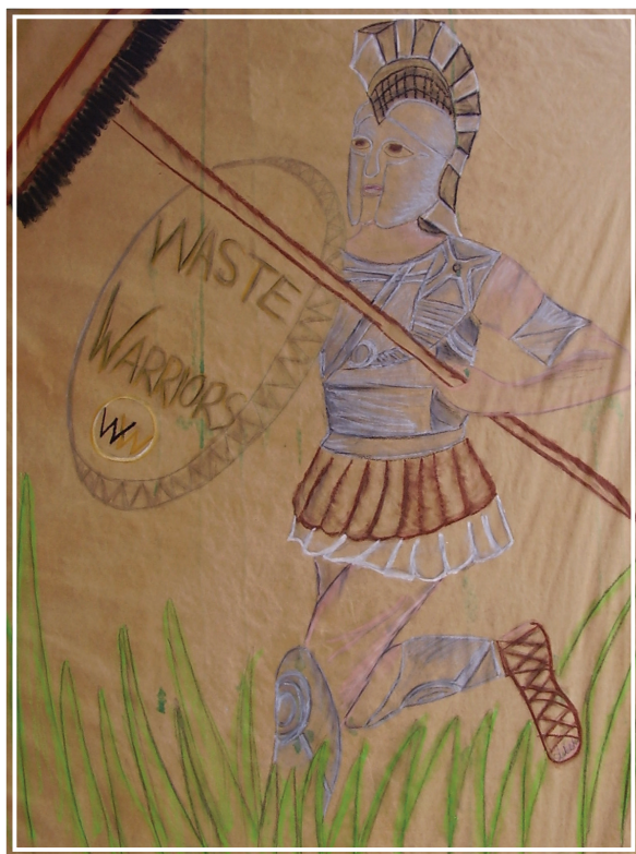
Entrance to 'Waste Warriors' classroom

A council community environmental grant of $1 000 in 2004 assisted in purchasing materials to further 5c collection and composting programs, including safety equipment and tools for students.