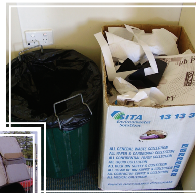
Classroom paper / card collection

A compost and garden area is being planned in 2006 after a recent site redevelopment.