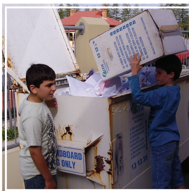
Students manage paper collection