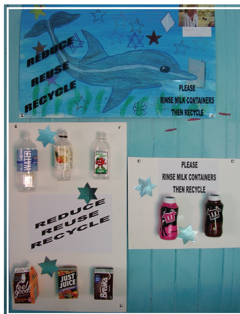
Excellent signage in canteen area

Marine Discovery Centre staff and volunteers promote caring for catchments through the schools SOSE and Science program and to other visiting schools.