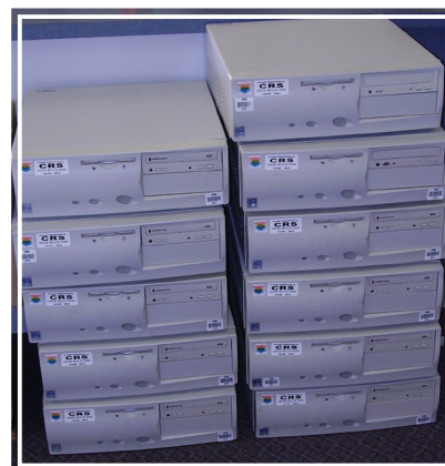
Quality, low cost computers from CRS