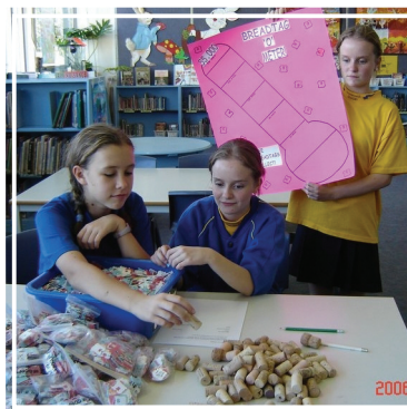
Counting collections with 'Bread-tag-o-meter' at rear

The school has adopted the KESAB Better Bag enterprise program to reduce reliance on single use plastic bags in the wider community. This program is managed, promoted and monitored by a team of students.