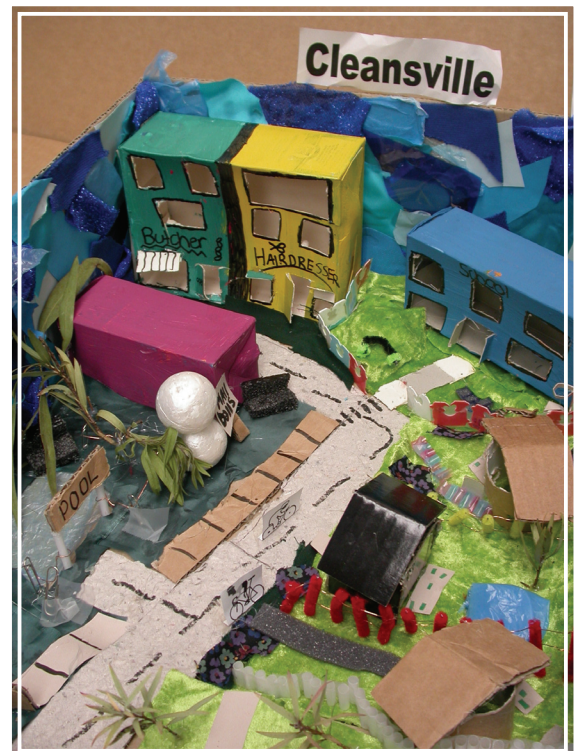
2005 KESAB Environmental Art Challenge entry