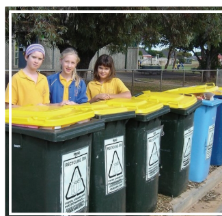
Recycling collection supported by local council

Recycling of a wide range of materials is carried out by Student Action Teams. Materials include 5c containers, paper / cardboard, glass bottles, film plastic, bread tags, corks, cartridges, and ring pulls from aluminium cans. Food scraps are composted for the Food Garden, and produce is used in the Canteen, cooking programs and sold to staff.