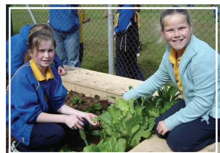
Wonderful produce in the Food Garden!