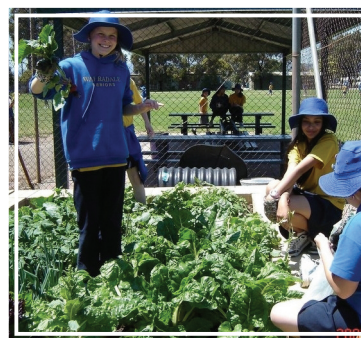
Healthy eating from Food Garden