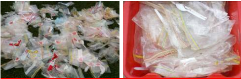
Ziplock bags and Cutlery