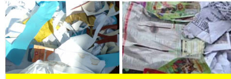
Paper & Cardboard