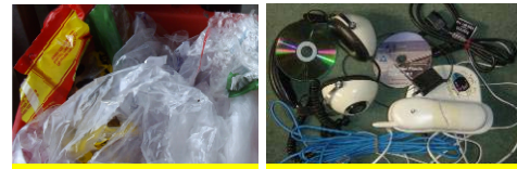
Clean Soft Plastic