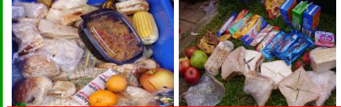
Uneaten food (still wrapped & uneaten)