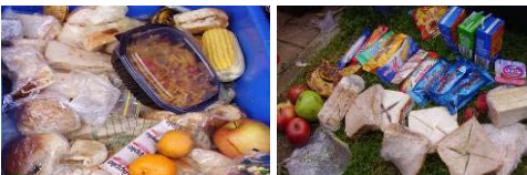
Uneaten food (still wrapped & uneaten)