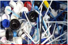
Food & Drink Packaging